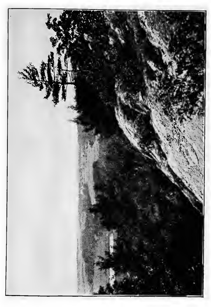
A BRIGHT HILLTOP IN THE BREEZY AIR